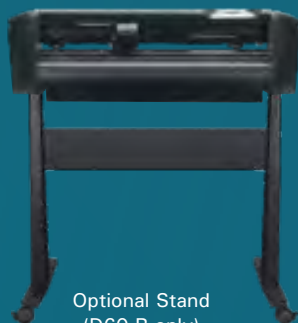
Optional Stand (D60-R only)