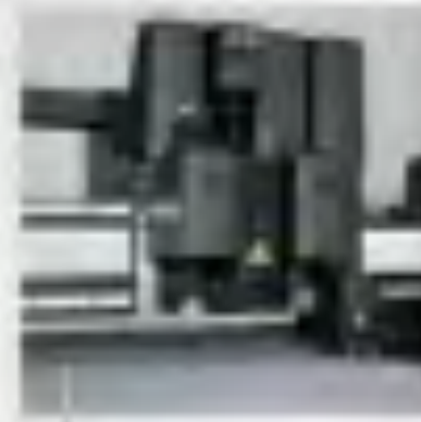
Multi Functional Head

Thanks to the conveyor system, material is also be fed in cutting through jobs.