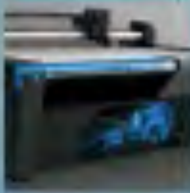
Vacuum Table with Vacuum Selector & Vacuum Pump, Sound absorber and Switching Valve

The powerful vacuum pump with sound absorber holds the material steady in place during the job. Moreover, by blowing under the material that floats over the table, the electronic switching valve makes loading and unloading a child's play.