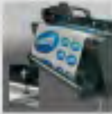
Media advance Clamps, Roll support and Conveyor System.

Multiple material handling options ensure optimal workflow for roll, sheet and board material.